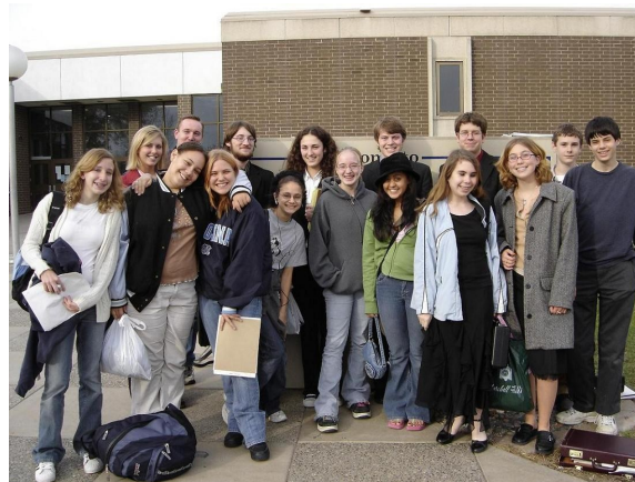
2006-07 Group Photo Don't miss out on what promises to be another exciting Year of debate.

In addition to the coaching staff, several of the varsity students will be on hand to offer support and help to those starting debate for the first time.